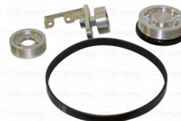
PULLEY KIT WITH POLY-V BELT D.100 RATIO 1: 1.75