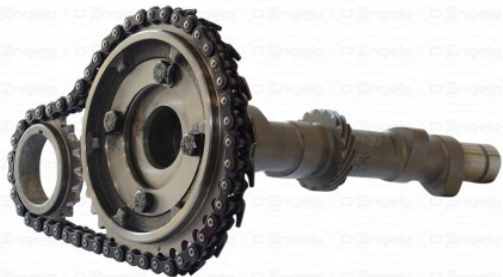
CAMSHAFTS FOR FIAT 500