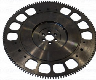
STEEL FLYWHEELS VARIOUS SIZES