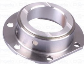
FRONT BENCH SUPPORT IN STEEL TIMING SIDE STD