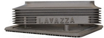
OIL PAN in two pieces of 5.5 liters for fiat 500