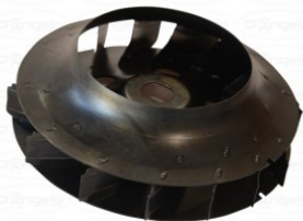
REINFORCED RACING FAN FOR FIAT 500 F-L-R