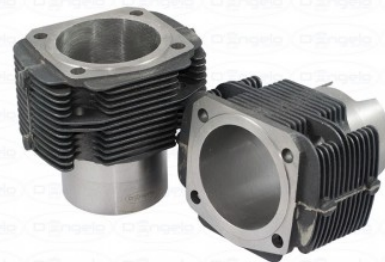
CYLINDERS FOR FIAT 500