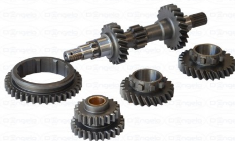
KIT 3rd / 4th SHORT FRONTAL 1 Z 12 AND RETRO GRAFT