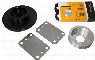
RACING POLI-V PULLEY KIT FOR FIAT 500 F-L-R