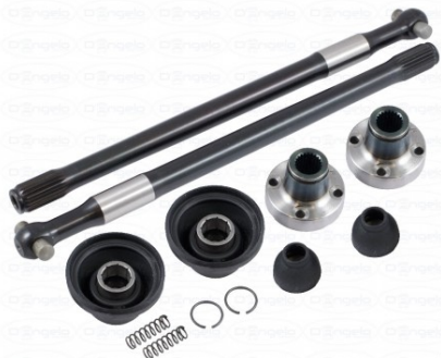
HIGH RESISTANCE STEEL HALF-AXLES COMPLETE KIT FOR FIAT 500 F-L-R