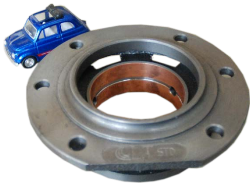
REAR BENCH SUPPORT