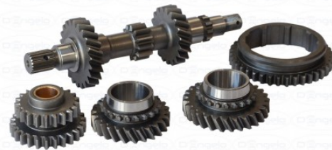
KIT 3rd / 4th SHORT SYNCHRONIZED 1 Z 12 AND BACK