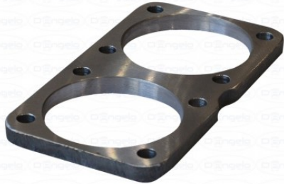
SUB-CYLINDER PLATES OF VARIOUS SIZES