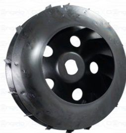
NEW REINFORCED ROAD FAN FOR FIAT 500 F-L-R